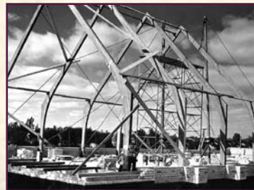
The new sanctuary's arches take shape

Property was acquired at 5300 France Avenue South in Edina, just two blocks north of the chapel building. On April 11, 1948, ground was broken for a marvelous, two-story sanctuary building that would seat 300 people for worship, with Sunday school in the lower level. The new church building was dedicated on Easter Sunday, 1950.