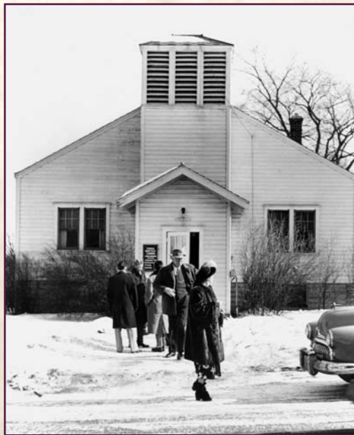
The first chapel home of the France Avenue Mission—later renamed Edina Baptist Church

Bringing Faith to Life... an apt description of what the people of Grace Church have been doing for more than 80 years. By God’s sovereignty, what began as a home Bible study in 1928 has grown to a congregation of thousands.